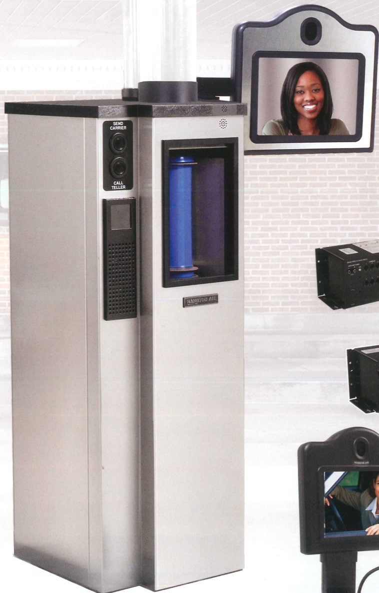
HA-1000 Upsend with Model 5517 Customer Video