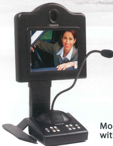
Model 5550 Teller Video with 5501 Series Audio Console