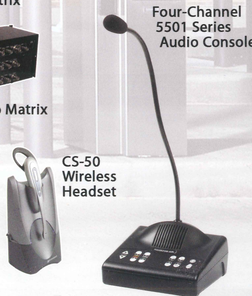
Four-Channel 5501 Series Audio Console