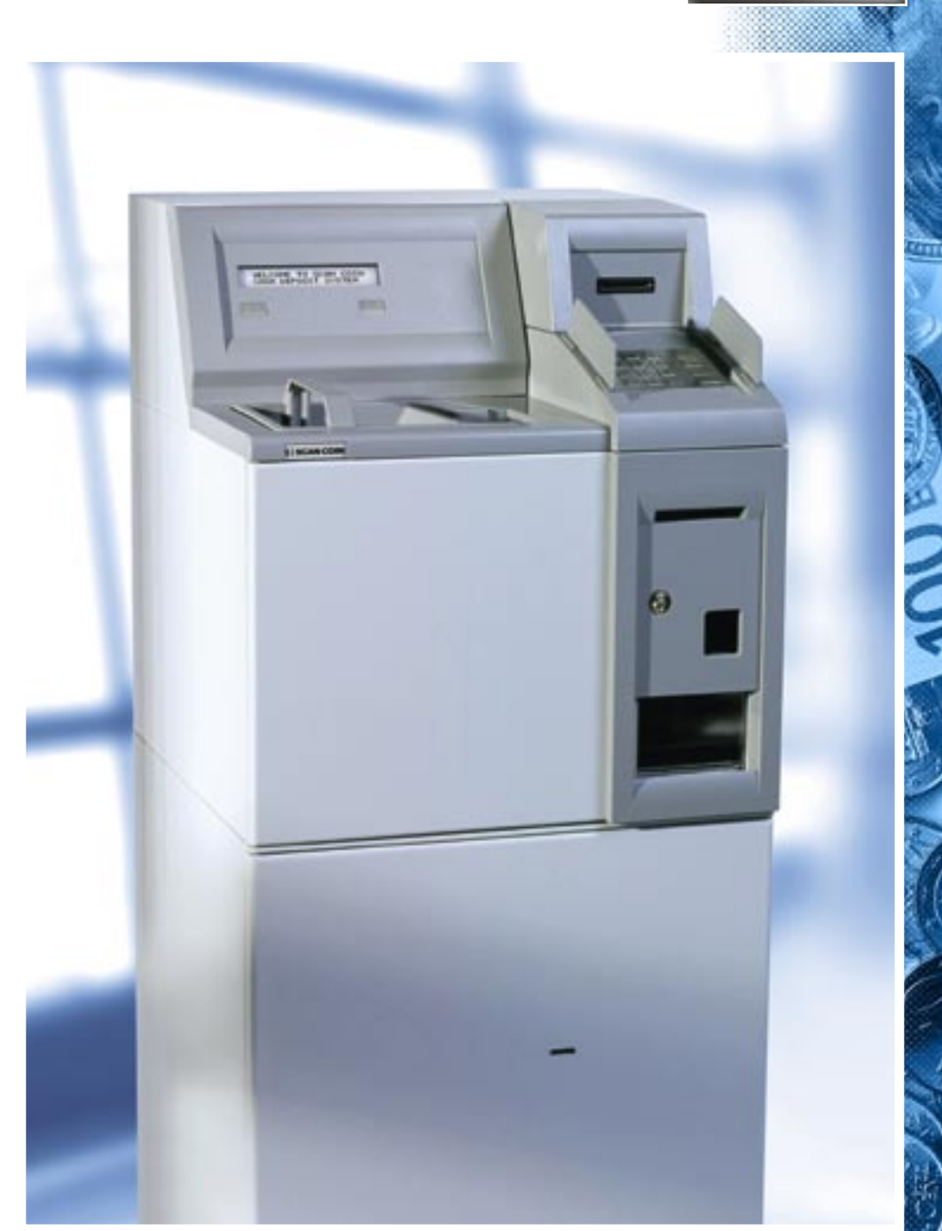
The picture shows a CDS 820 with optional motorised card reader and customer keypad.